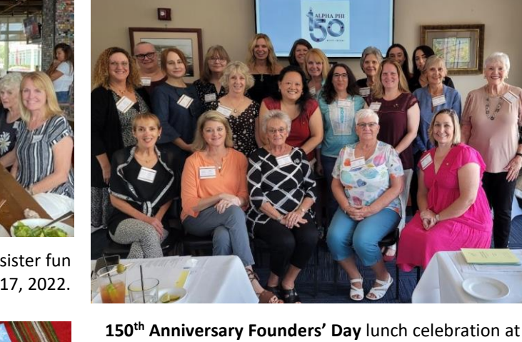
150 <sup>th</sup> Anniversary Founders' Day lunch celebration at THE HANGAR restaurant, St Petersburg, Oct 15, 2022