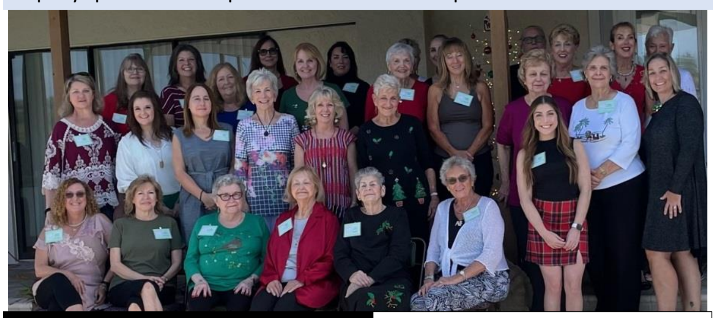
Happy New Year from the Tampa Bay Alumnae Chapter

OUR DEC 3, 2022 HOLIDAY BRUNCH FUNDRAISER